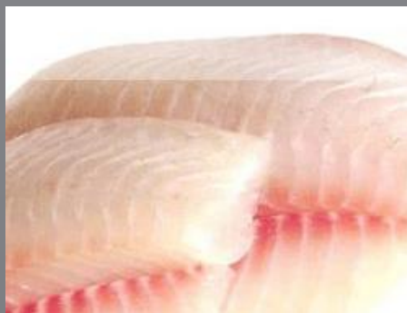
Peruvian Blue Tilapia

Peruvian Blue Tilapia Fillet All Natural Farm Raised, Peru $5.75/lb