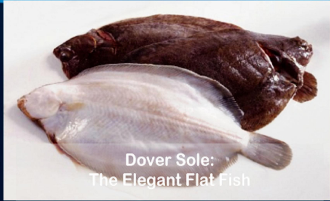
Dover Sole: The Elegant Flat Fish

Named after the town in England that sits on the English Channel, Dover Sole is similar to the flounder. A pancake flat fish with both eyes on one side of its head, making it well adapted to living on the ocean bottom. Dover Sole produces a protective slime that may spread to other fish when it's caught in a net. It can grow to a maximum of 2.5 feet or 76cm. Its fans consider Dover Sole considered the most elegant of all the world's flat fish species. True Dover Soles are found in the eastern North Atlantic. There are similar looking but completely different Dover Soles that are found on the west coast from the Behring Sea to Baja California. If the skin can be peeled off, then you know you have a true Dover Sole. The inherent quality of this west coast fish is no match for the North Sea variety. Our fish are from marine fisheries not fish farms. They are primarily caught with trawls and other types of fishing gear including hand lines and traps. Chefs prize this fish because of its firm textured flesh can handle any preparation - rolled, stuffed, sautéed or broiled. When cooked the glistening white meat becomes moist, dense flesh with a mild, sweet flavor that easily adapts to sauces. The average weight is about one pound, but the smaller the fish the more delicate the flavor. For the full flavor, cook the fish on the bone and fillet tableside for a stunning presentation.